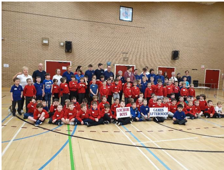
A Group Picture of all the Anchor Boys