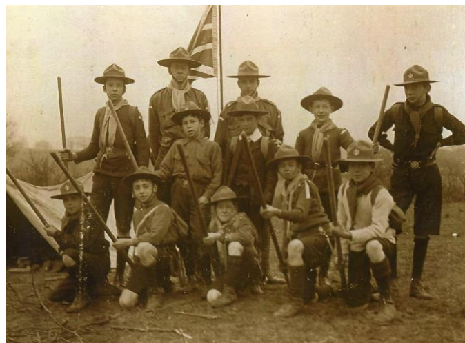
6th Enfield BB Scouts 1909