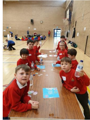
Anchor Boy Beetle